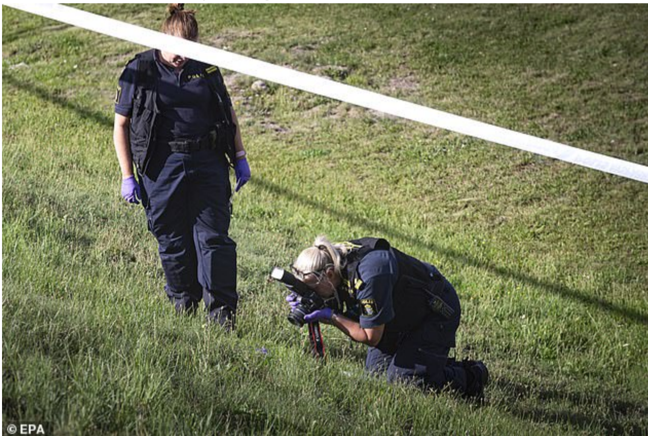
Police take photographs as they gather evidence after a 12-year-old girl was shot dead in an allegedly botched drive-by shooting, in Botkyra, south of Stockholm yesterday