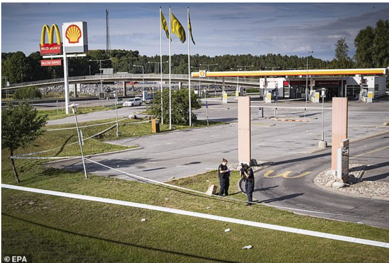
Police working at the site today, where a twelve year old girl was shot near a petrol station in Botkyrka, south of Stockholm, Sweden on Sunday morning