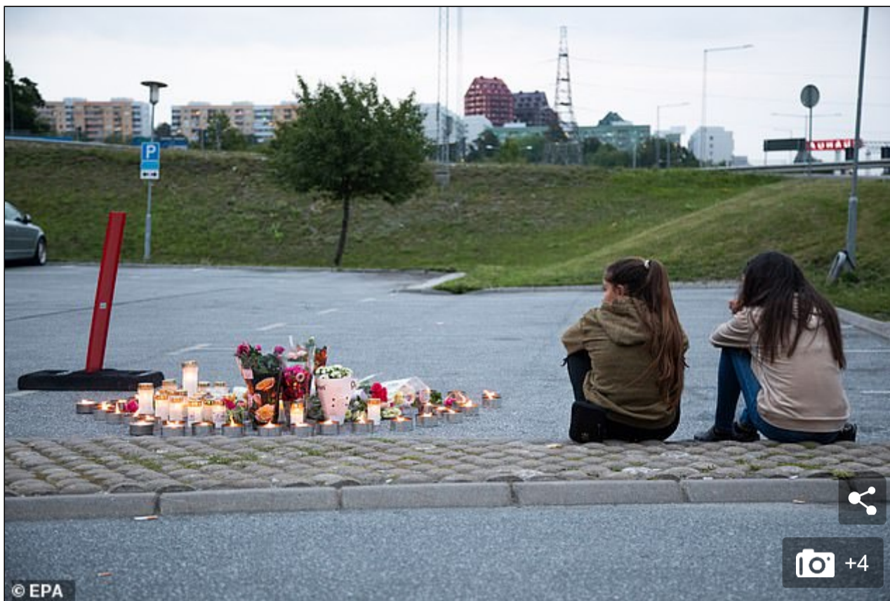
People pay tribute by putting candles and flowers at the site where a twelve year old girl was shot near a petrol station in Botkyrka, south of Stockholm, Sweden today