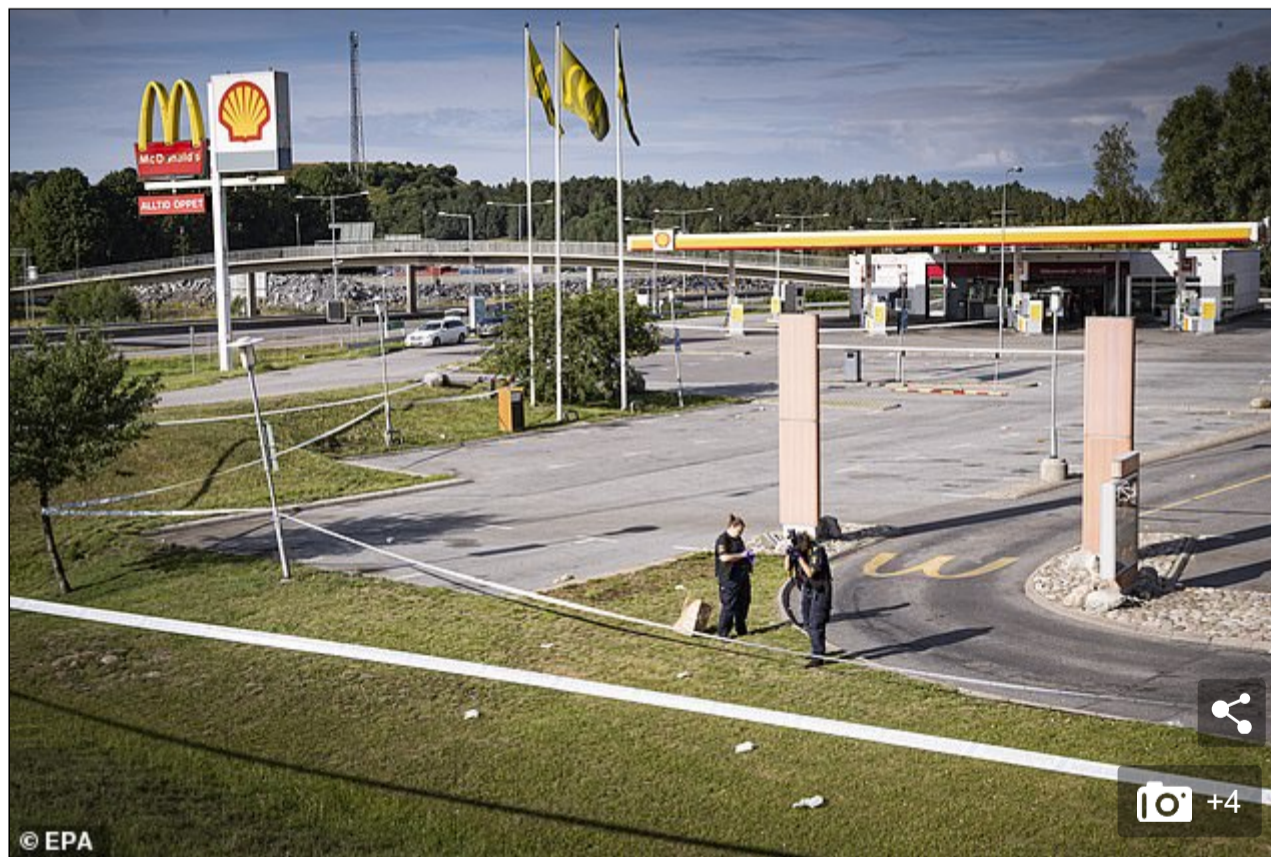
Police working at the site today, where a twelve year old girl was shot near a petrol station in Botkyrka, south of Stockholm, Sweden on Sunday morning