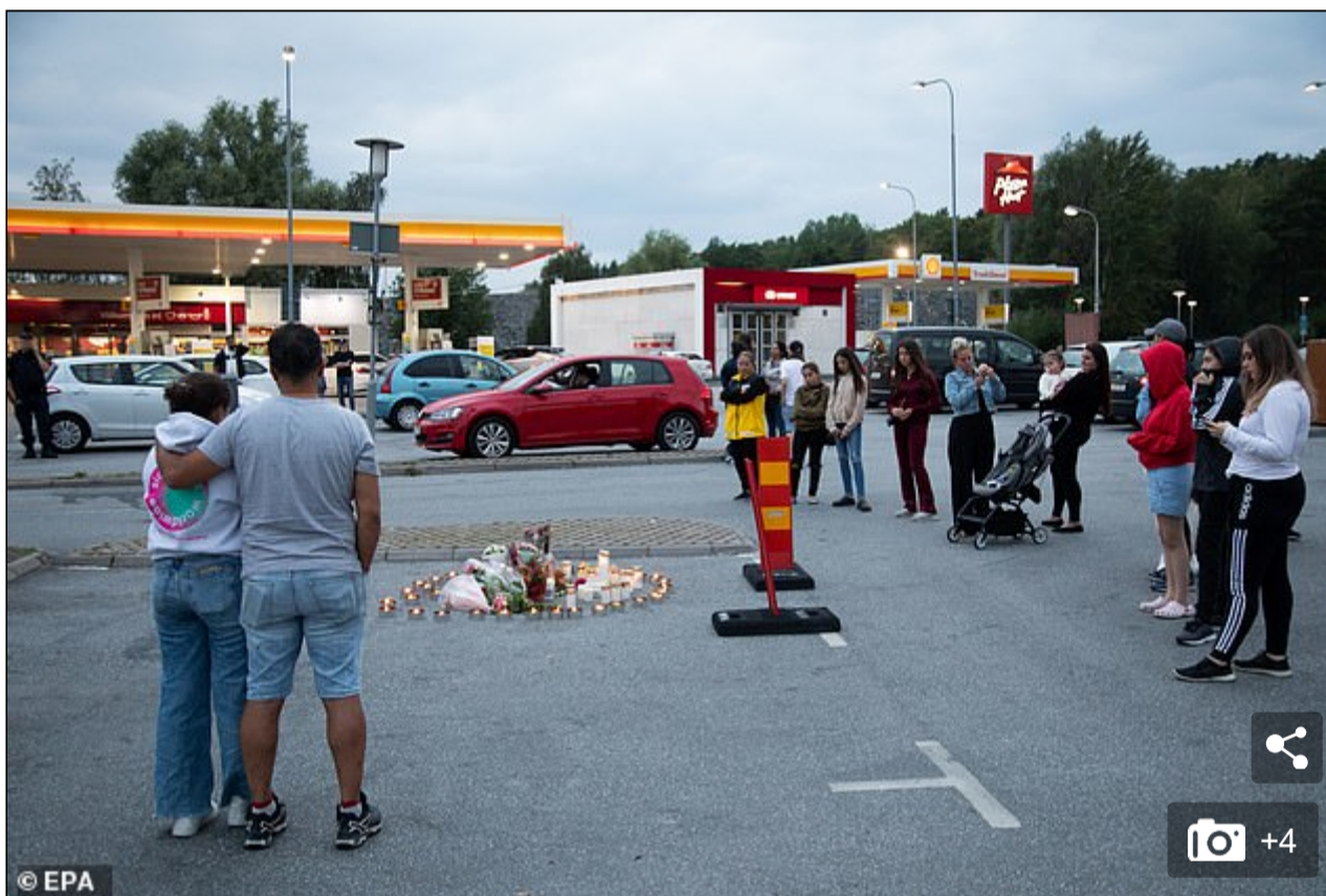
People pay tribute by putting candles and flowers at the site where a twelve year old girl was shot near a petrol station in Botkyrka, south of Stockholm, Sweden, today. The girl was taken to hospital, but later died from her injuries

No arrests have been made, but police told AFP that they had opened a murder investigation and were seeking information about a white car seen at the time of the shooting.