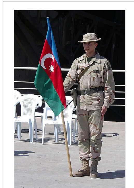
Azeri soldier in Haditha, Iraq, March 2005. U.S.-Azeri ties intensified following the establishment of diplomatic relations after Azerbaijan's independence in 1991. Azerbaijan supported the U.S.-led military operations in Afghanistan, Iraq, and Kosovo.

After 9/11, Azerbaijan supported the U.S.-led military operations in Afghanistan, Iraq, and Kosovo, as well as the international sanctions that drove Tehran to sign the 2015 nuclear agreement (JCPOA). When Washington re-imposed sanctions against the Iranian regime in 2018, Baku suspended oil and gas deliveries to Tehran. 8 The Bush, Obama, and Trump administrations reciprocated by extending Azerbaijan a waiver to the 1992 Freedom Support Act, making it possible for