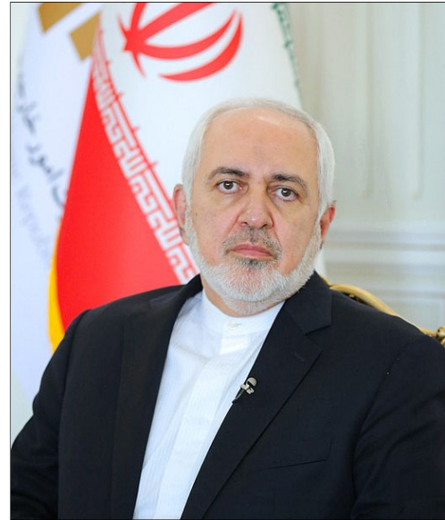
The Iranian ayatollahs adopted an ambiguous policy that sought to placate both sides of the Nagorno-Karabakh conflict. Iranian foreign minister Javad Zarif (above) offered “to provide good offices to enable talks.”

Torn between these opposing pressures, the ayatollahs adopted an ambiguous, at times self-contradictory, policy that sought to placate both sides while seeking a quick end to the fighting. 19 “Iran is closely monitoring the alarming violence in Nagorno-Karabakh,” tweeted Iranian foreign minister Javad Zarif upon the outbreak of hostilities on September 27. “We call for an immediate end to hostilities and urge dialogue to resolve differences. Our neighbors are our priority and we are ready to provide good offices to enable talks.” 20